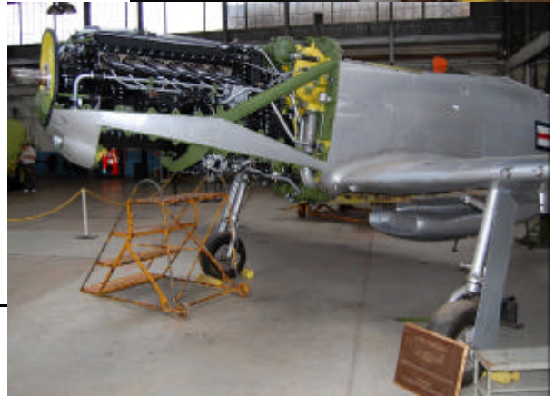
Yeah; Jets are nice but who could ignore A P51 Mustang? I should have asked the restorer is I could have a seat but I didn't dare. (It seems combat planes and I don't get along. Page 3)

This upcoming meeting will be used as an event-planning meeting for next year's club events. If you can't attend and want to chair an event email a club officer.