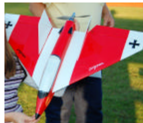
Joe Winters showed off this 'Delta Rocket' the plane is supposed to go 70MPH. Joe was ready to double Corben's test pilot fee to fly