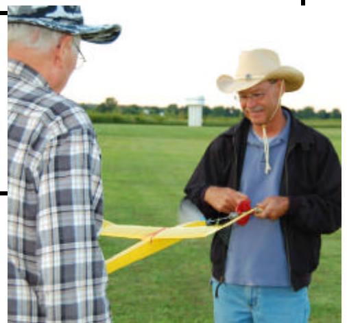
We conducted the 'builder's challenge' with only three competitors approaching the flight line. However the resultant flights were elegant and fun to watch. And even winding one can bring a smile to your face.