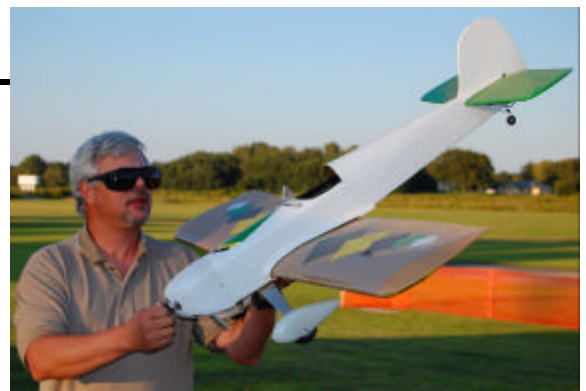
Now, while it hasn't flown yet it is setup with a FX46OS a sublime muffler and Dave Brown tail wheel.