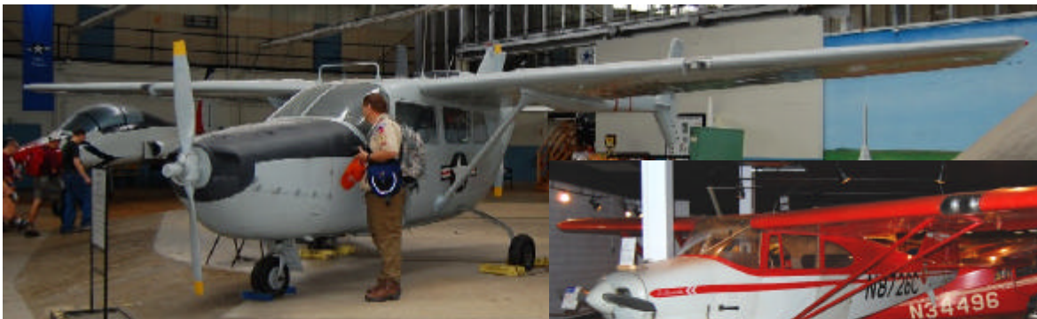
Chanute Air Museum is long on jets and work in progress and to be done but there are 'props' and real showpieces too.